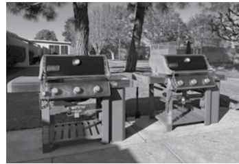
table near the grills, but you may wish to bring your own supplies and chairs. After you are finished, be sure to clean the grills for the next person to use. Return the key to the office. Enjoy!

You know you cannot use your portable barbecue in your patio – a big fire hazard and illegal. Have you seen the two barbecues over by the tennis courts? They are between the courts and the buildings. They are available for all residents to use on a first-come, first-served basis. The grills cannot be reserved. Get a key from the office or from Security if the office is closed. They are gas grills. There should be a